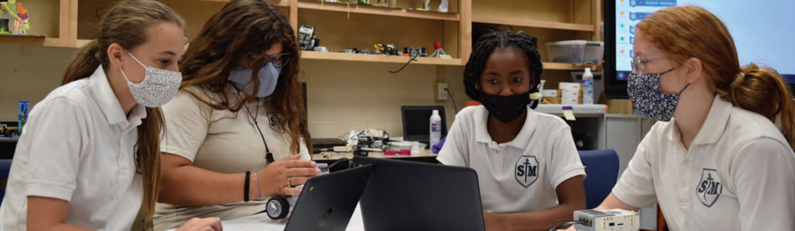
ST. MICHAEL SCHOOL STEM & MAKER SPACE LAB