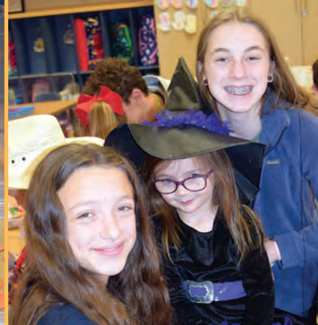
HALLOWEEN CELEBRATION WITH SAINTS PRE-K4 AND 8TH GRADE BUDDIES