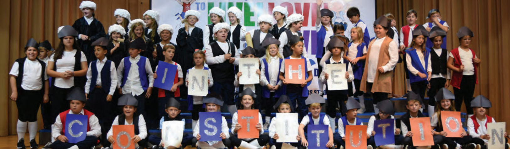
CONSTITUTION DAY 2022! CELEBRATING THE USA RED, WHITE, & BLUE!