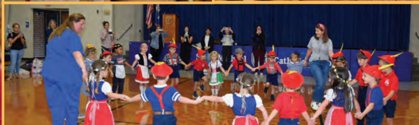
ST. MICHAEL SCHOOL PREK4 CELEBRATE GERMAN DAY!