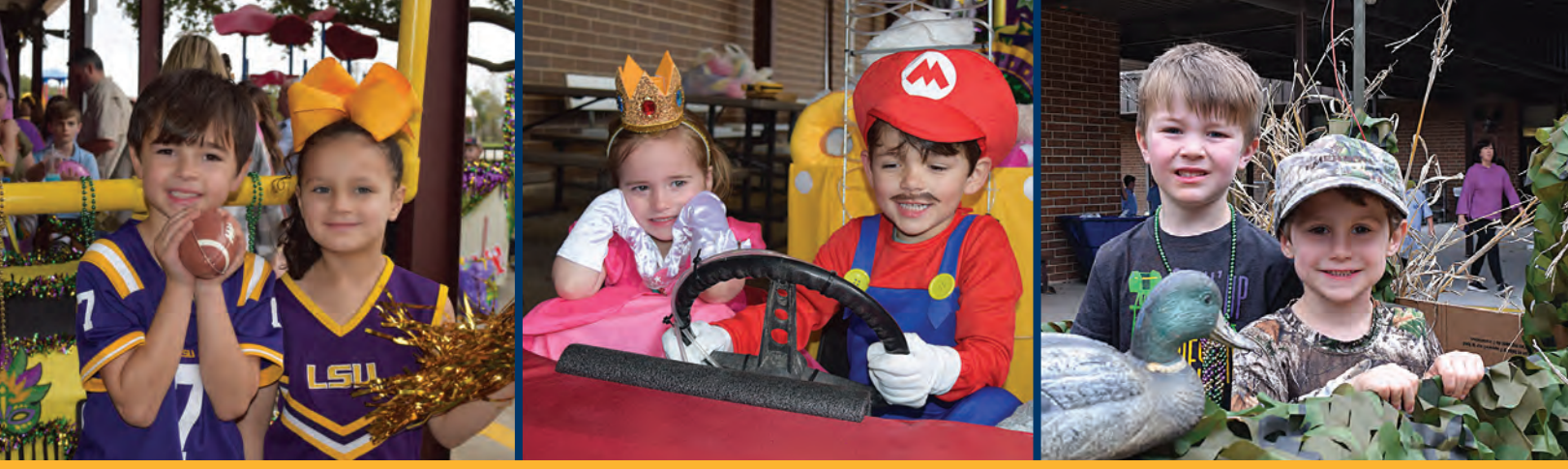
ST. MICHAEL SCHOOL KREWE DE PRE-K MARDI GRAS PARADE