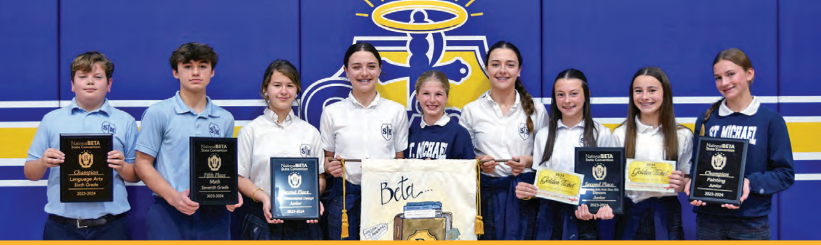
ST. MICHAEL SCHOOL JR. BETA SATE CONVENTION