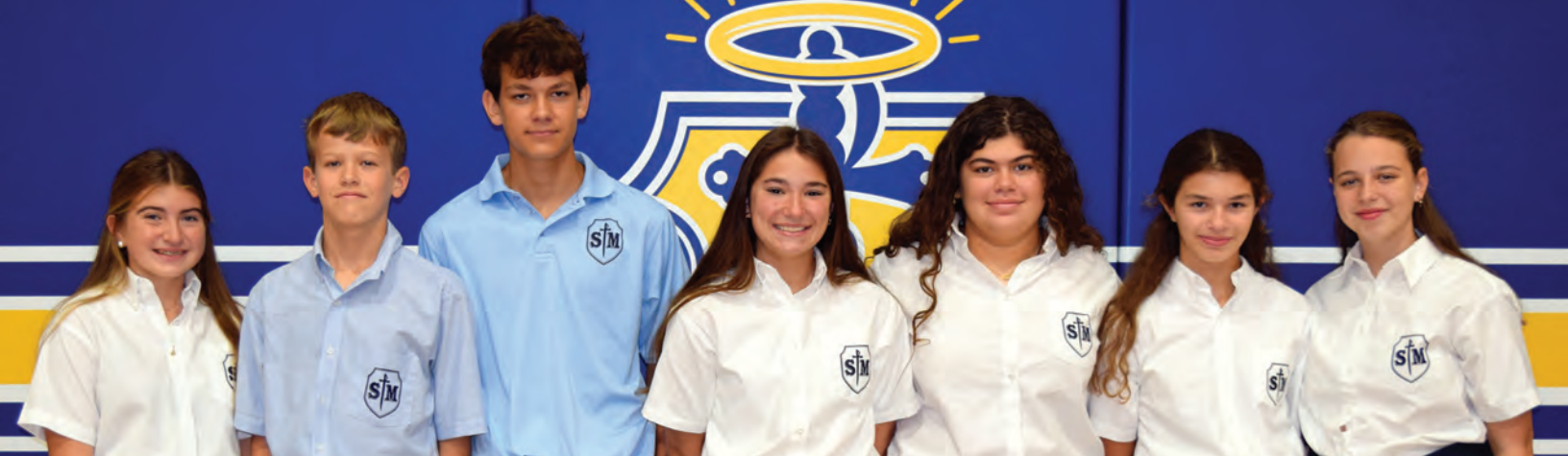
ST. MICHAEL SCHOOL STUDENT COUNCIL OFFICERS 2022-2023