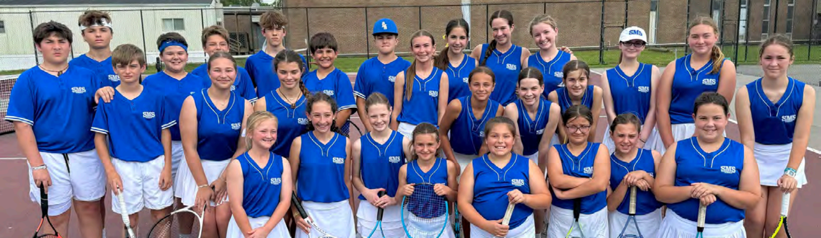
FIRST ST. MICHAEL SCHOOL SAINTS TENNIS TEAM 2024

Our Saints Track teams' season has also come to an end. These athletes did an outstanding job representing our school. The 5th/6th grade and 7th/8th grade Saints Girls Track Team finished their season by winning the League Championship. Our 7th/8th grade Saints Boys track team finished 3rd. Way to go SAINTS!