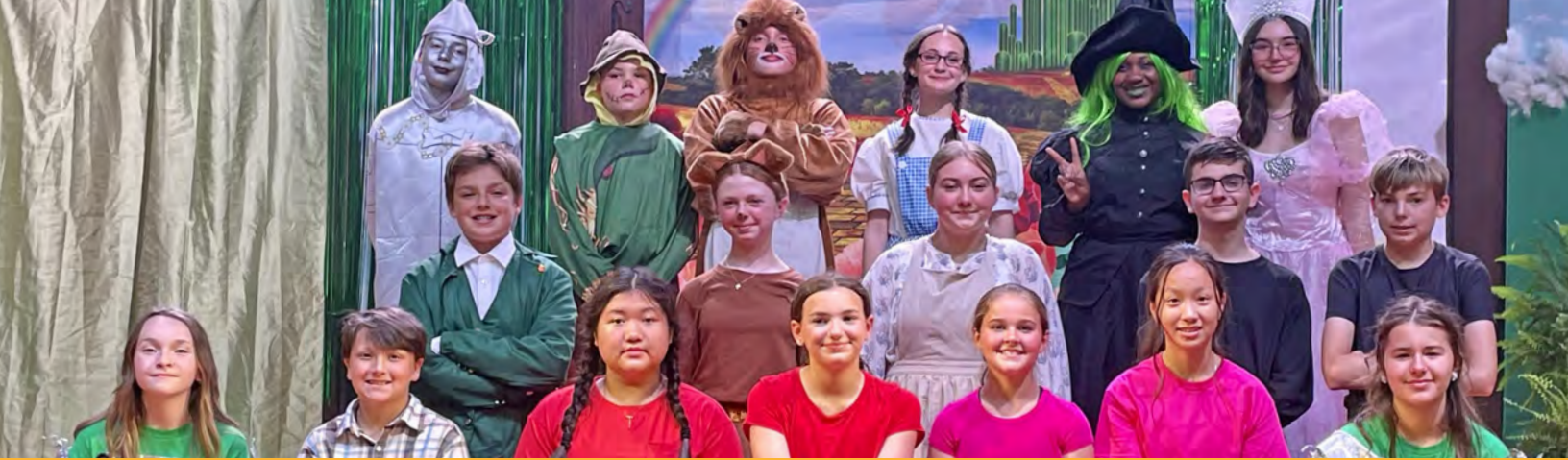
ST. MICHAEL SCHOOL JR HIGH DRAMA CLUB "THE MAGICAL ROAD TO OZ"