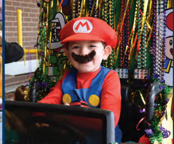
ST. MICHAEL SCHOOL KREWE DE PRE-K MARDI GRAS PARADE