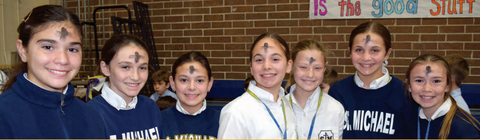
ST. MICHAEL SCHOOL ASH WEDNESDAY

St. Michael School's annual Saints Cake Auction was a great success, raising over $20,000. This money will be used to improve the athletic program and to support the Saints Robotics and Saints Quiz Bowl teams. Our Saints Robotics team will be competing in Houston in April at the National competition and the Saints Quiz Bowl team will be competing in Chicago at the National competition. Thank you to everyone who donated cakes and parties and to the volunteers who gave their time to work the auction. A special thank you to our community for their donations in supporting our students.