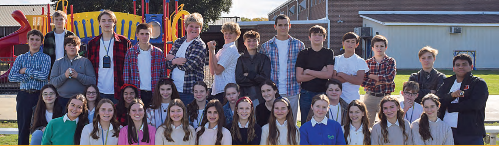
ST. MICHAEL SCHOOL 8TH GRADERS "THE OUTSIDERS"