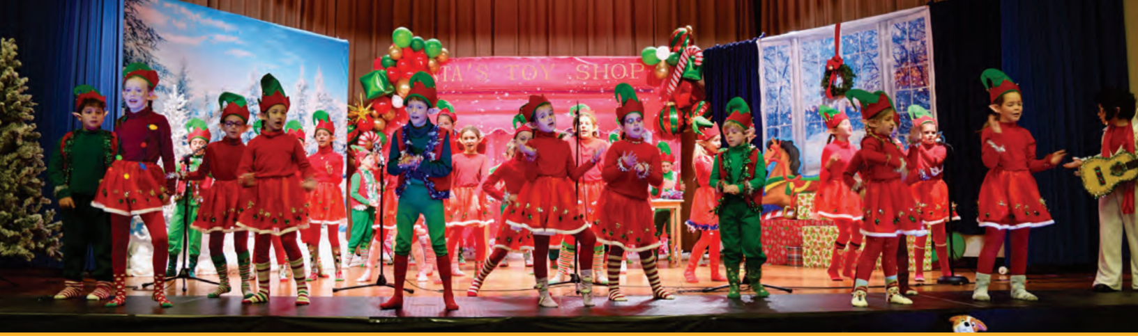
ST. MICHAEL SCHOOL 3RD - 5TH GRADE DRAMA CLUB CHRISTMAS PLAY "THE ELVES' IMPERSONATOR."