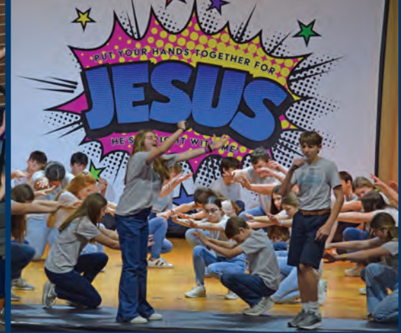
ST. MICHAEL SCHOOL SCHOOLS FAITH RALLY 2023