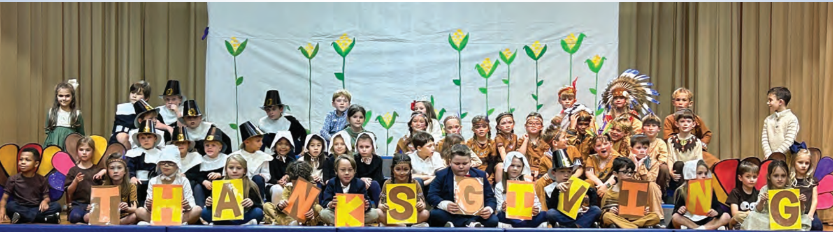
ST. MICHAEL SCHOOL 1ST GRADE PLAY "THE FIRST THANKSGIVING"